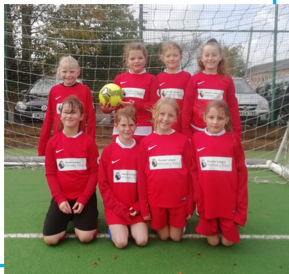
Friends of Alverton School (FOAS)